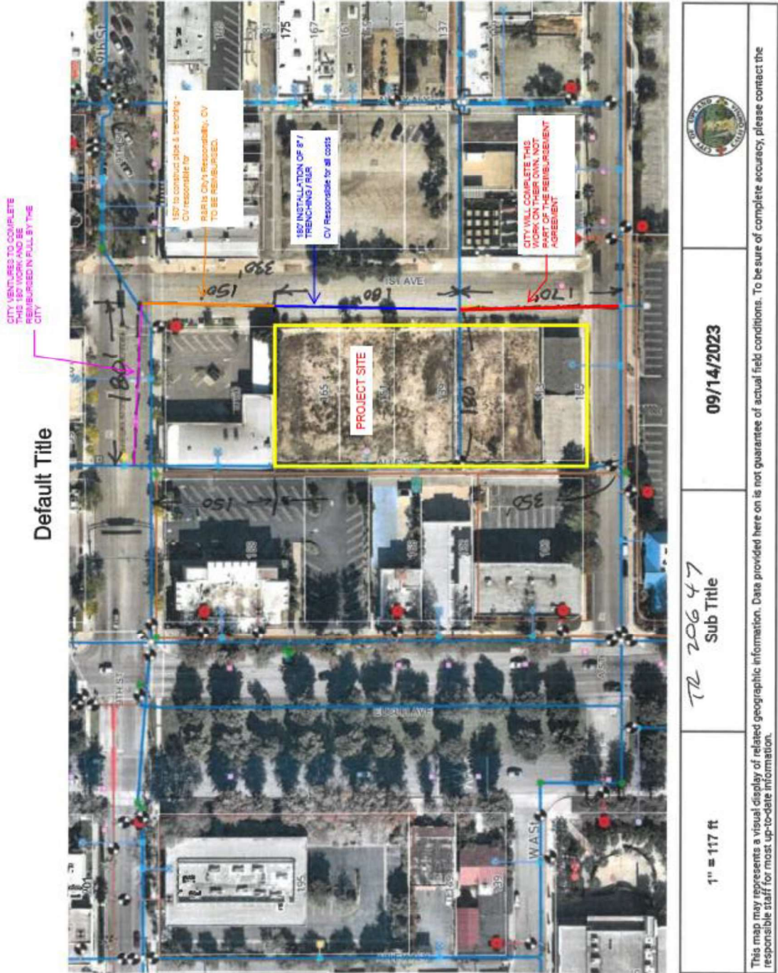
EXHIBIT A SITE PLAN